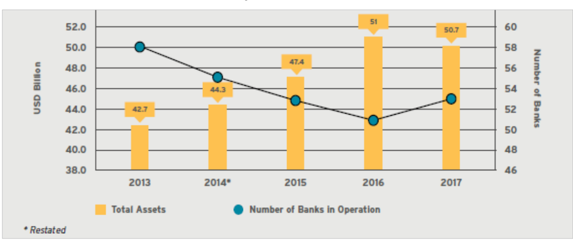
Total Assets and Number of Banks in Operations

The assets, comprising mainly loans and advances contracted marginally by 0.5% to USD50.7 billion during the year. Nonetheless, there was a significant hike in Islamic financing by 61.6% due to increased demands for shariah compliant financing.